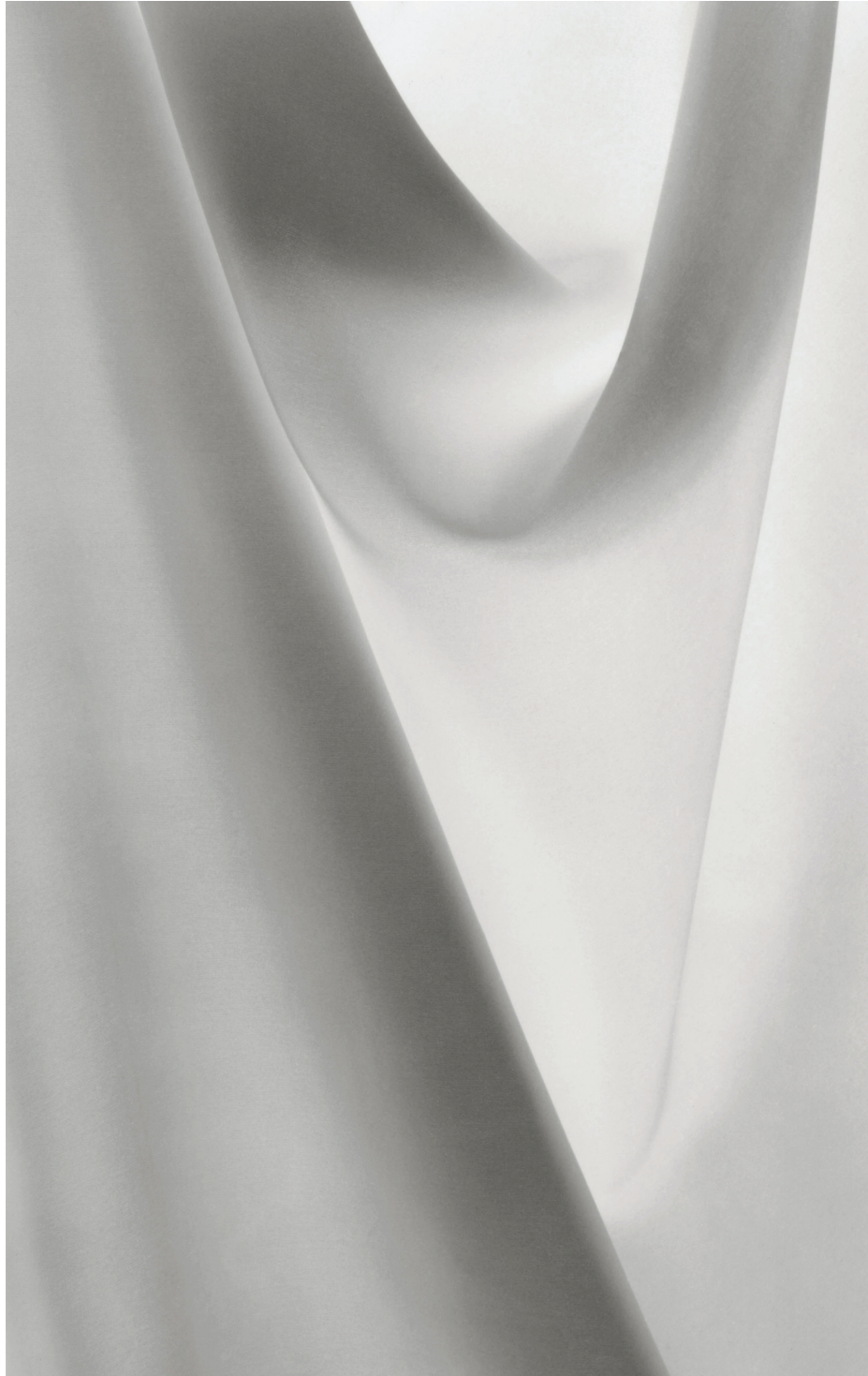
Passage #02-30, 2002-2011, pigment print 46 x 28.5 inches, edition of 6 plus 2 APS