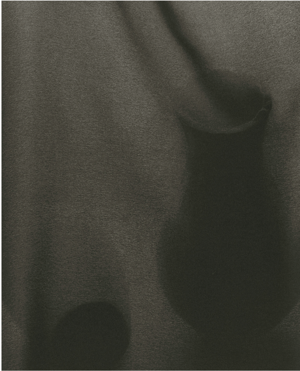
Veiled Still Life #46b, 2002, gelatin silver print 24 x 20 inches, edition of 5; pigment print 2010, 42 x 34 inches, edition of 6 & 2 APs

Which is precisely why, when traversing the halls of work at AIPAD this year, four images from different bodies of work by Lynn Stern, cut the wheat from the chaff. As an artist trained extensively in traditional wet room photography, Lynn Stern has long been known for her work with still life, translucent cloth, large-format cameras and film in the 80's, an exquisitely productive period after which many would come to know the artist officially as an 'abstract' photographer. For the art world luminary, now in her 80's, photography is her tool, not her medium. The subject isn't the object Stern paints, but rather, the lilting play of light and shadow.