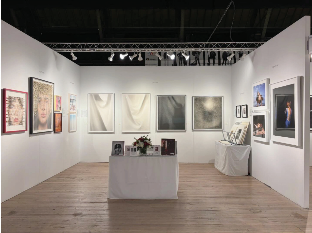
Installation view, Obscura Gallery at AIPAD