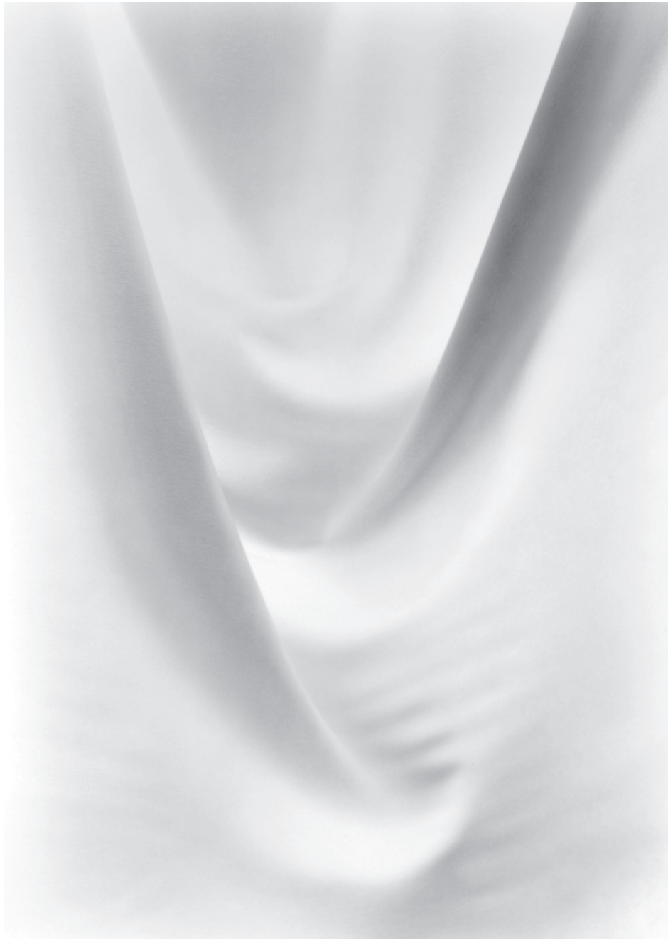
Passage #85-33a, 1985-2011, pigment print 46 x 33 inches, edition of 6 plus 2 artist's proofs

While smartphone technology can transform snapshots taken by novices into seemingly professional images, it concurrently amplifies the demand for high-value, experimental niche art photography. Even artificial intelligence falls short in replicating emotionally raw, human-directed moments, which remain a pivotal element in photography's ongoing evolution from a primarily utilitarian and objective medium to a highly specialized, experience-driven craft. The proliferation of contemporary artists striving to counteract the flood of mediocre slop, coupled with a resurgence of interest in analog photography among the youth, suggests a preference for a more tactile and less immediately gratifying creative experience. Ultimately, what is fading is the outdated notion that photography ever served as a reliable form of 'truth-telling' or objective evidence of life.